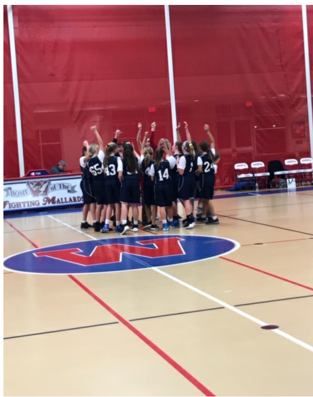
Our Varsity Girls Basketball team celebrates their win over Worcester Prep!