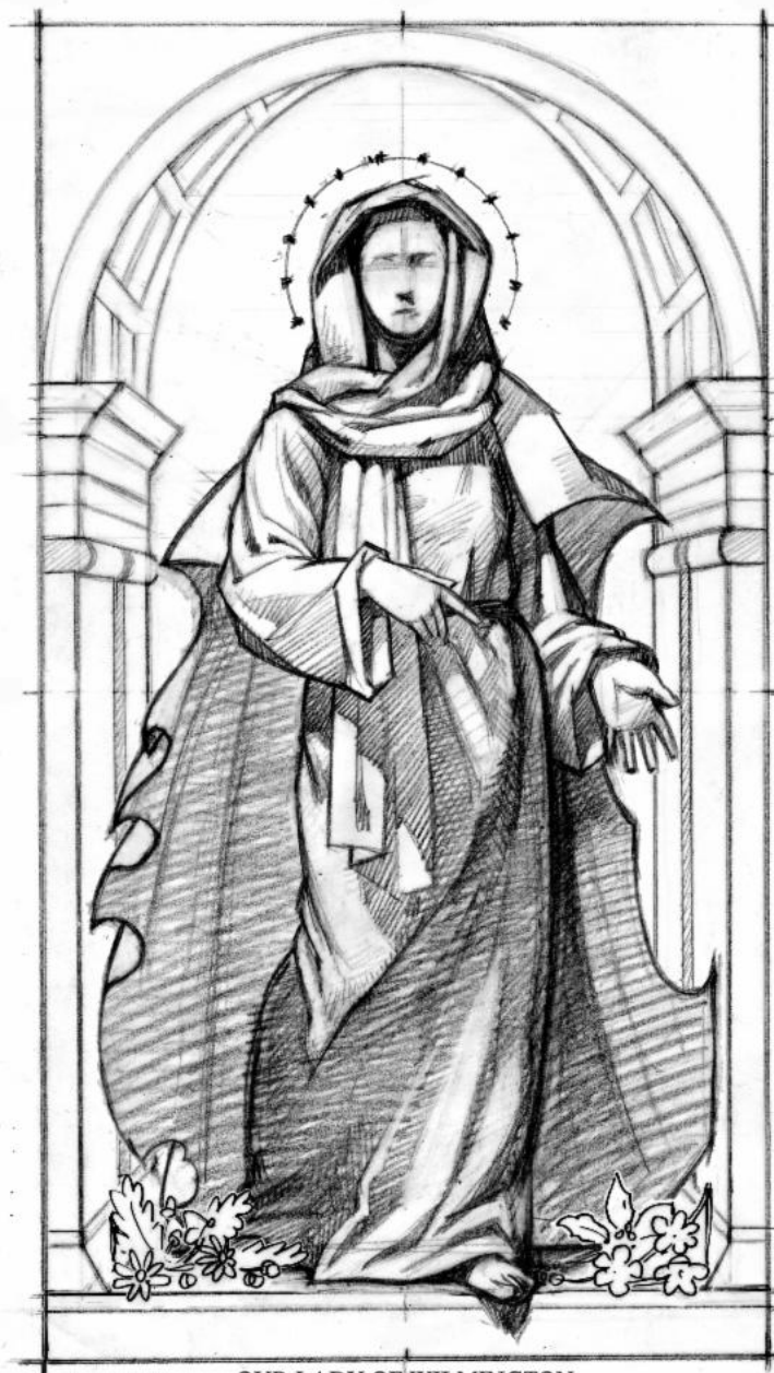
OUR LADY OF WILMINGTON