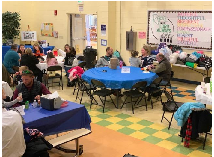
Top Row left to right: Family Luncheon, Valentines for Veterans Bottom Row left to right: Family Luncheon fun