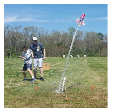
Brayden Bosley (grade 5)