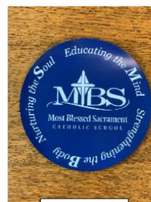
Car Magnet $5